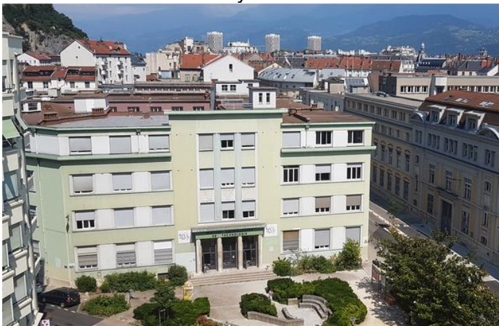
IUT2 GEA Verdun square